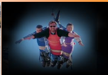
Or they can Fly and Touch the Sky.....