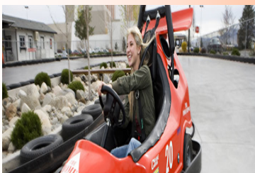
Friends can go "Fast Like A Nascar!".....