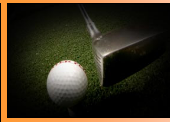
While the rest can swing away like Tiger Woods.....